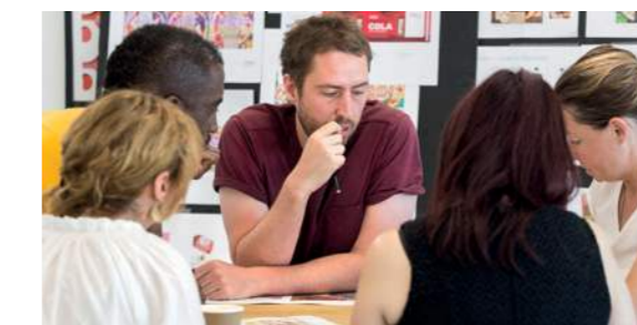
Ogilvy & Mather, a Living Wage employer

Living Wage South Bank incorporated multiple engagement opportunities, with feedback and contributions from a range of business sectors informing the research and the report. This encompassed: gauging awareness of the Living Wage accreditation process and potential barriers; project promotion; 121 meetings; and business seminars. Overall, more than 250 business were engaged in the project.