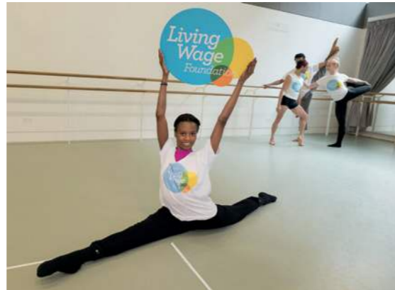
Rambert, a Living Wage employer

We look forward to working with employers, business groups, Business Improvement Districts and others in the continuation of this work.